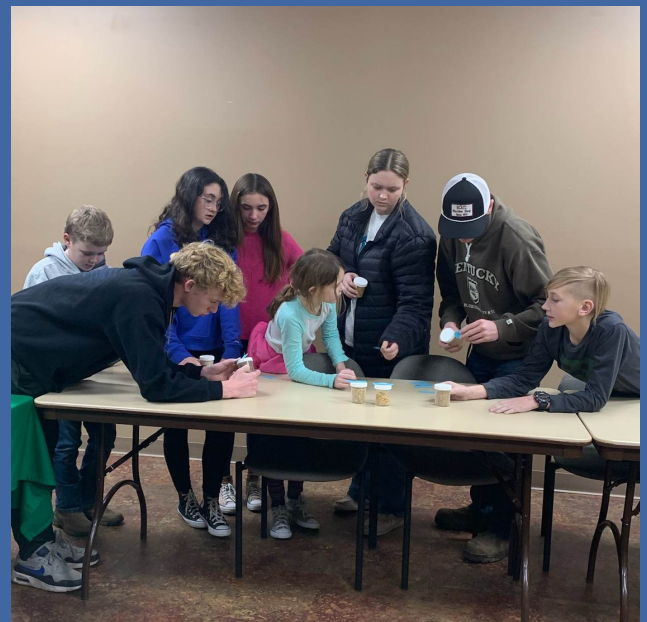
The 4-H Livestock Club team up to learn and identify feed samples during the January meeting on nutrition