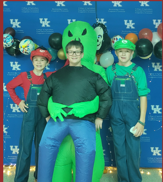
4-H Trailblazer Club Members at the 4-H Fall Fun Dance in October