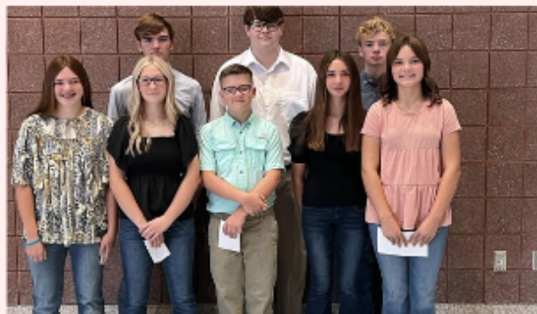
2023 4-H Country Ham Team at the KY State Fair