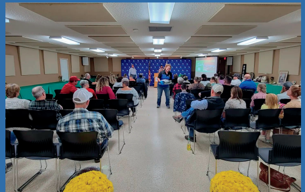
Thank you to all who came out to the 2021-2022 Breckinridge County 4-H Auction and Awards Night