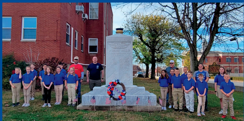
The 4-H Treble Chorus visited the old courthouse downtown to place a Veteran's Day wreath at the Veteran's monument.