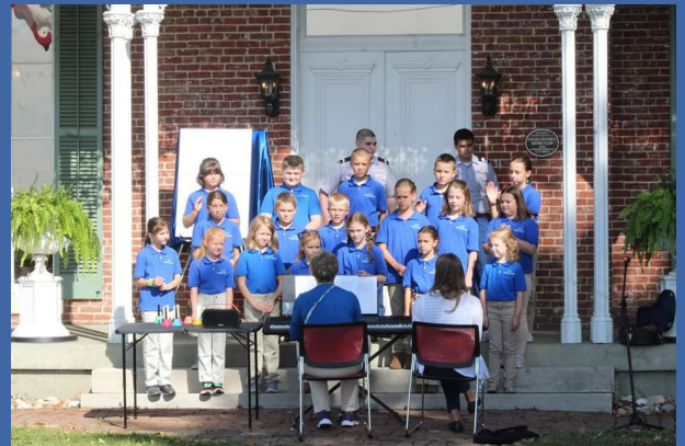
The Breckinridge County 4-H Treble Chorus performs at the Holt House Community Day. See page 2 for more.